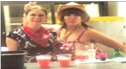
L: Mocktail bar