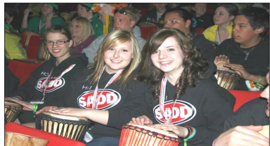
R: Delegates join Drum Café.