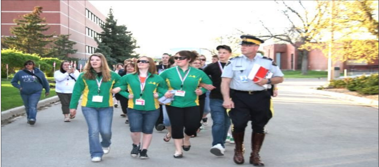
CYAID Delegates took part in a tour of the RCMP Depot and Museum.