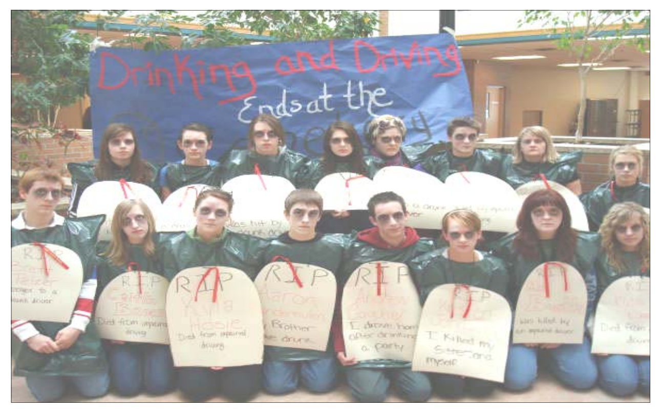
Winston Knoll SADD Chapter White Out Day

This past school year was WINSTON KNOLL COLLEGIATE's first year in having a SADD Chapter (Regina). One fundraiser raised $150! Sixteen teachers, for one week, volunteered their parking spots to the student raffle winners. Nearly $200 was raised selling bags of candy hearts in February. During Impaired Driving Awareness Week , cutouts of bodies with impaired driving facts were placed about the school. The week ended with a White Out Day. This began with the sounds of a vehicle collision being played over the intercom. Next, two paramedics and the school resource officer entered a classroom and removed a "whited out" student by stretcher. The student symbolized death by not speaking for the rest of the day. These actions were repeated until a total of 16 students and two staff members were "whited out." At the end of the school day, Winston Knoll students gathered to witness how many people are killed by impaired driving throughout a typical day.