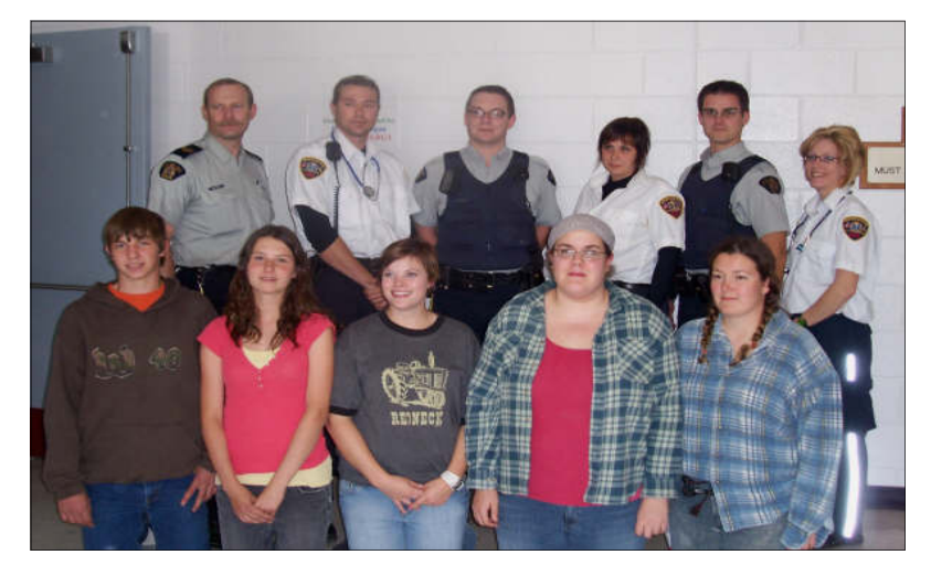
Oxbow Prairie Heights School

A February fundraiser included a Chili Bake Off, and in May, a Sundae Sale.