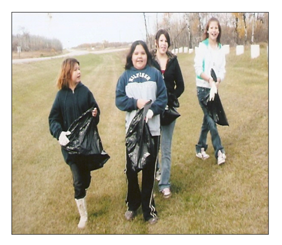
Community Service Day

During the school year, SADD members attended the conferences, had presenters, did presentations and made posters. They also made stepping stones with slogans. Another fundraiser was a 2008 calendar showcasing activities and members of the SADD Chapter. It included messages that students can have fun without using alcohol or drugs.