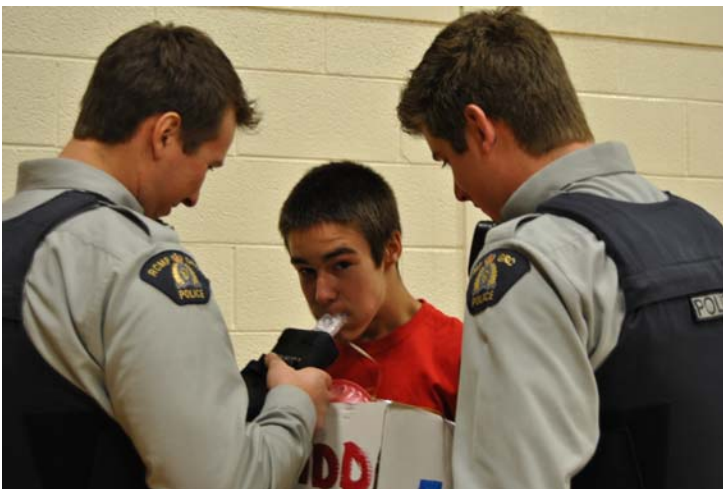
One of the racers got a little reckless and was pulled over by the police for a breathalyzer test.

Don't break anyone's heart... Don't Drink and Drive.