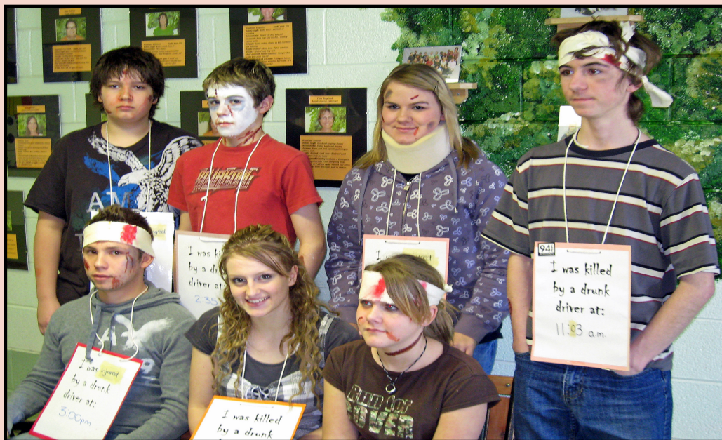
Members of Whitewood School SADD promote awareness on "Whiteout Day."

During Whiteout Day, fatalities were honoured and students became "injured" throughout the day. The SADD Chapter held a contest for most (paper) red ribbons purchased at one dollar each. The winning class won a pizza lunch.