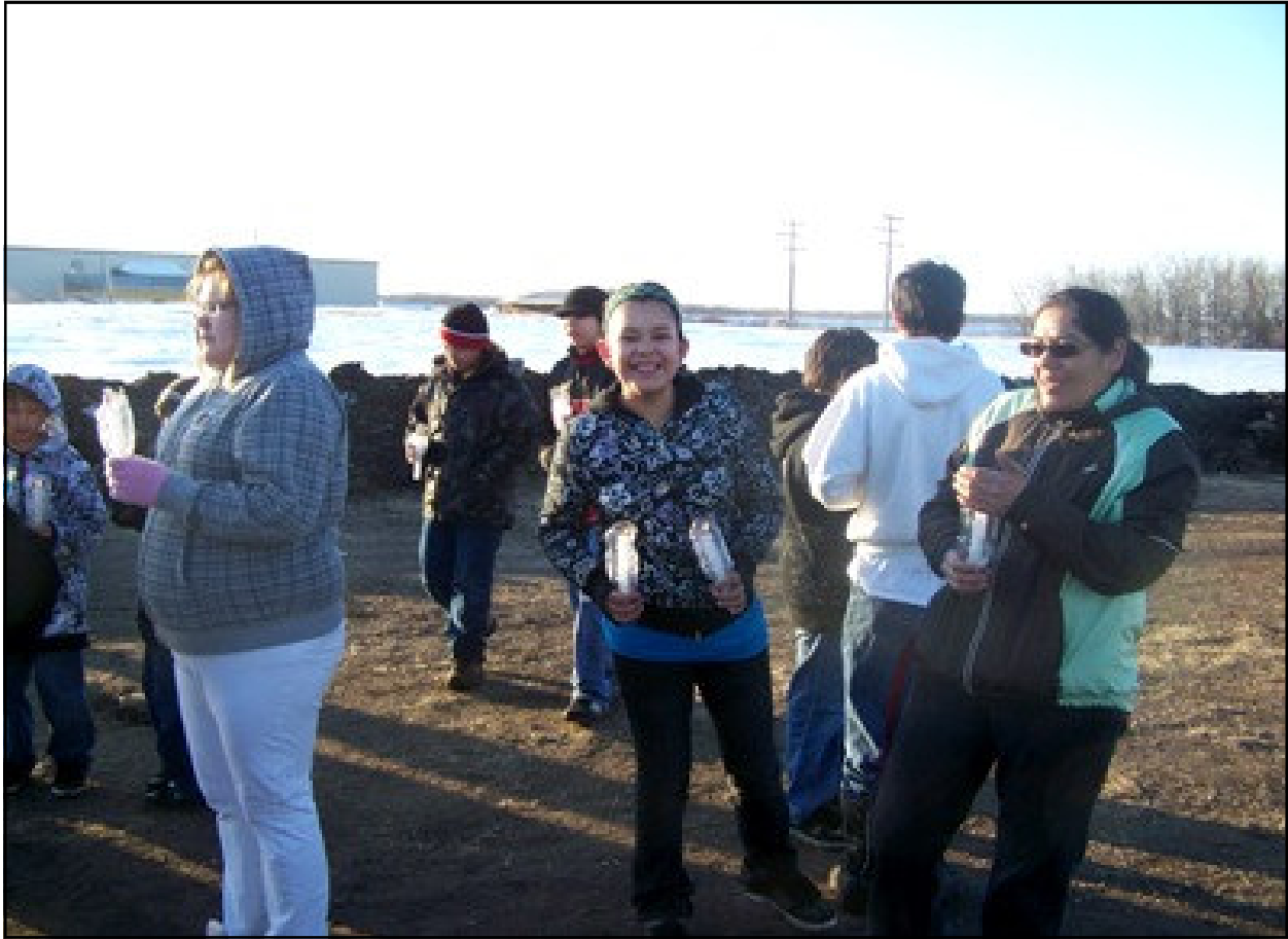
Cst. Robin Cameron Education Centre Memorial Candle Walk

CST. ROBIN CAMERON EDUCATION COMPLEX held a Memorial Candle Walk on March 30. The RCMP escorted participants in the walk, which was dedicated to loved ones who have died in crashes due to drinking and driving. A hot dog roast was held afterward.